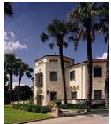
Marion Koogler McNay Art Museum San Antonio, TX