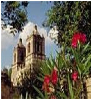
Mission Concepción San Antonio, TX

NETWORK WITH EXPERT PRACTITIONERS TO TRANSFORM YOUR BUSINESS