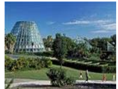
Botanical Gardens San Antonio, TX

MARK YOUR CALENDAR WE LOOK FORWARD TO SEEING YOU THERE!!